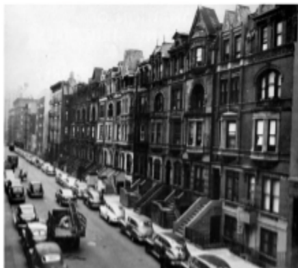
Photo used to demonstrate “blighted conditions” on West 98th and West 99th Streets in 1951 by Robert Moses’ Committee on Slum Clearance

On display at the Bloomingdale Library through February 29, 2024