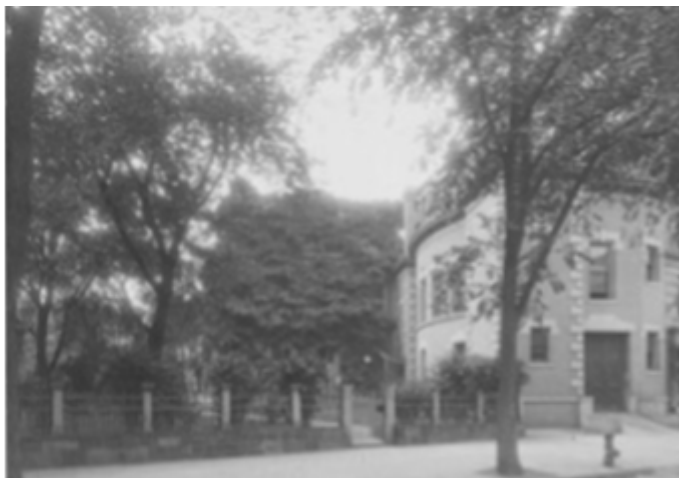
The house at 2745 Broadway, nearly obscured by vines, and the masonry stable building at 2747 Broadway.

This was a description of the property owned by Isador and Ida Straus. It was home to the Straus family from 1884 until Isidor and Ida perished on the Titanic in 1912.