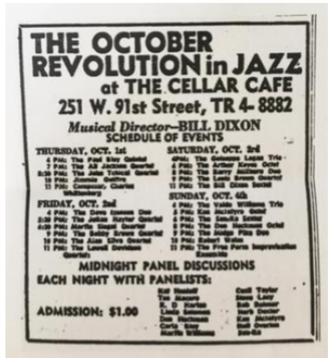
Poster for October Revolution in Jazz

In the summer of 1964, he began planning the early fall event, named for the October Revolution of 1917. Performances began at 4 pm each day, ending at midnight when panel discussions about the music would begin.