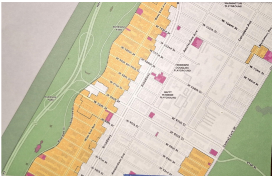
Map of Bloomingdale neighborhood

Click on a site, and up comes the address and a brief description. Click on the photo there, and up comes the whole Landmark Designation Report, as a pdf.