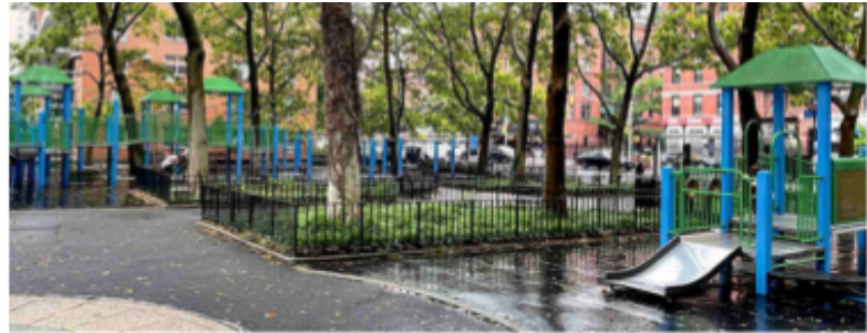
Happy Warrior Playground