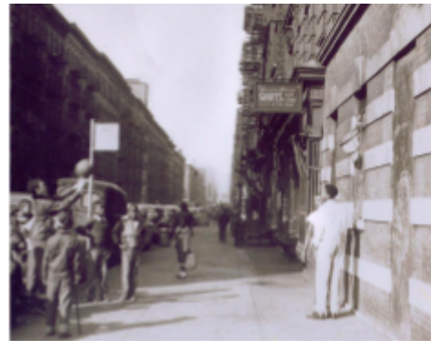
A game of basketball being played on the street corner at West 99th Street near Central Park West.

Timed to coincide with Black History Month, this illustrated talk focuses on the half-century life of the Old Community: its residents, its businesses, its activities, and its aftermath. As a special bonus, a former resident of the Old Community, or two, will be on hand to share stories and answer questions.