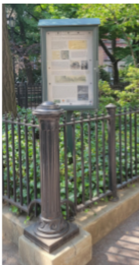
Strauss Park Poster

In collaboration with the Friends of Straus Park, BNHG has created a poster titled The Story of Straus Park . It relates information about the history of the creation of the park; the Straus family; the Memory sculpture in the park; and the history of the neighborhood.