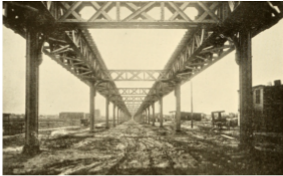
Ninth Avenue El

Free zoom presentation. Check here for the link.