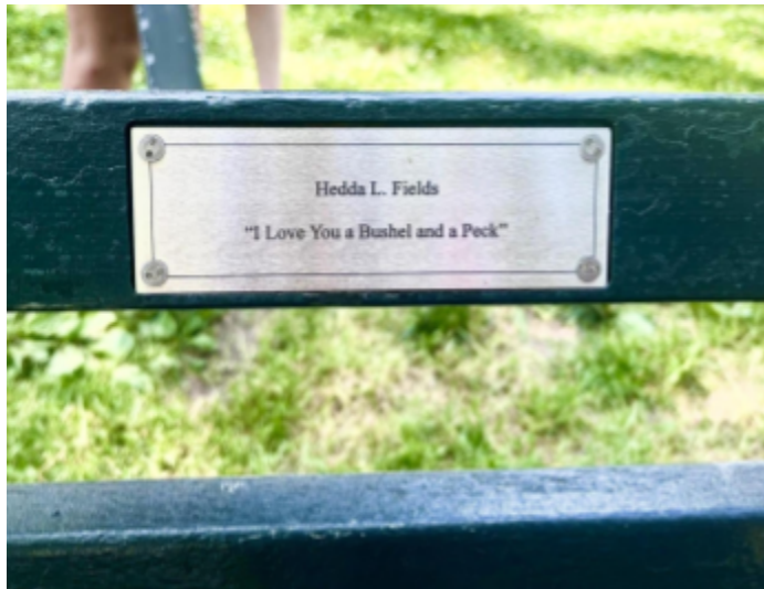
Hedda Fields' Central Park Bench Plaque

On April 7, 2023, family and friends gathered near a bench in Central Park at 97 th Street and Central Park West to remember and honor a wonderful neighbor, Hedda Fields. The Bloomingdale Neighborhood History Group remembers Hedda as one of its most stalwart members.