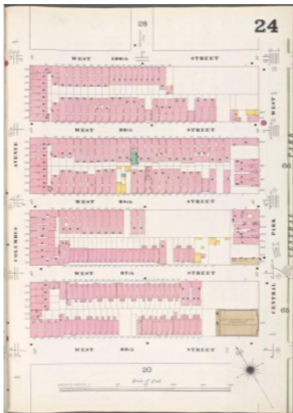
1902 map of W 100 th Street, Central Park West, W 96 th Street, Columbus Avenue, inclusive of the Old Community.

Origin of the Old Community – Around 1905, Bloomingdale was a lightly populated area, practically a suburb of the real New York City further downtown.