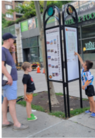
97th Street History Kiosk

A new Neighborhood History Kiosk is installed at Columbus Avenue and West 97th Street, in the tree bed near Whole Foods, a busy spot in the Bloomingdale neighborhood. It includes a map with history and information about the surrounding local area. It merits a look when you're nearby.